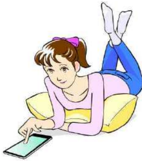
chat on social media