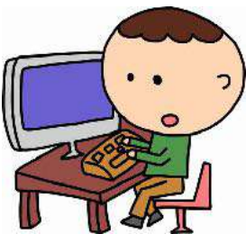
working on the computer