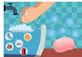
cleaning the house