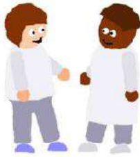
chatting to your friend

Put the pleasant activities in the 'like' column and the unpleasant activities in the 'dislike' column