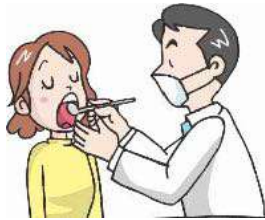
visiting the dentist