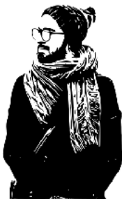
scarf and beanie