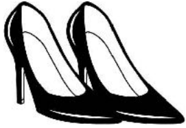
high heel shoes